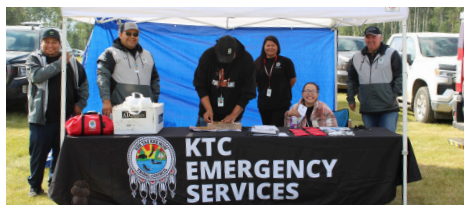
Woodland Cree First Nation Treaty Days August 22, 2024